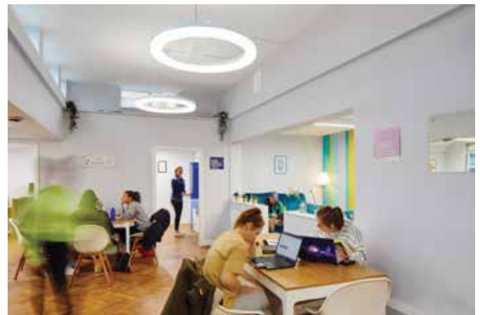
St Mary's University Twickenham, London