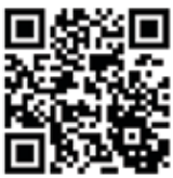
Facebook Fan Page

ODT is the process of re-engineering the business/-service practice and/or technology enabling firms to engage in new ventures in sync with exponential times while staying on purpose.